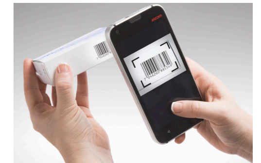
Provide personalized care. Caregivers can use the Ascom Myco 3 to access care plans, and the smartphone's barcode scanner to verify medication plans.