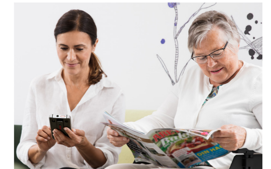
Multiple functions in a single smartphone. Caregivers can contact residents, coordinate with colleagues, manage alerts, and connect to technical and safety alarm systems.