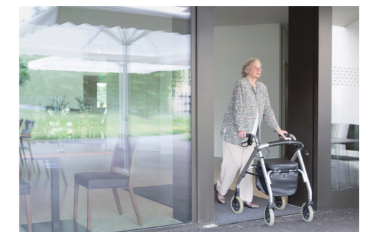
Locate at-risk residents. Data and residents' locations are clearly displayed on caregivers' Ascom Myco 3 screens.